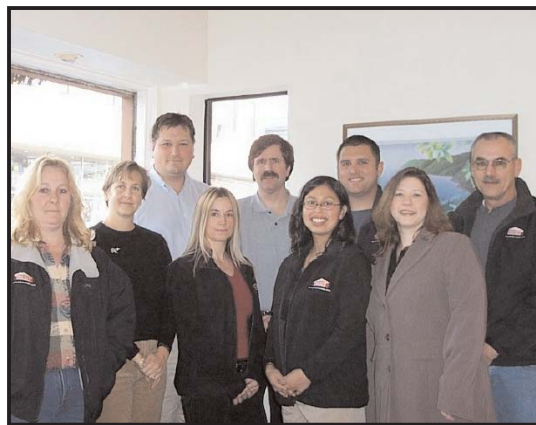
The Humboldt Property Management (HPM) staff

Property Management Professionals are dedicated to selecting quality tenants and keeping your investment in good repair with minimal cost. They want your real estate investment to be a success not a failure. One last benefit - your leasing and management fees are usually a tax deduction.